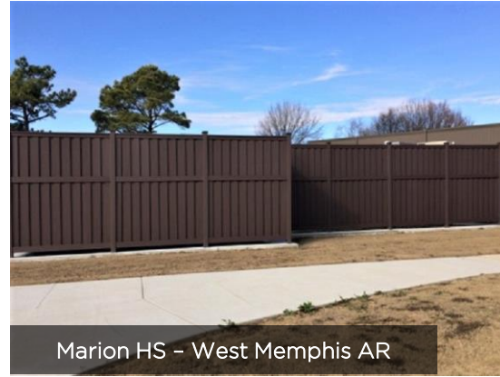
Marion HS - West Memphis AR