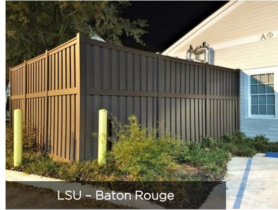
LSU - Baton Rouge