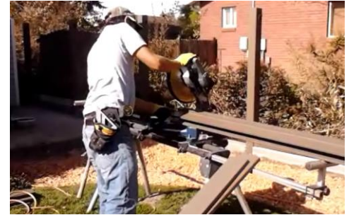
Trex materials are cut with miter and circular saws (non-ferrous blade is used for aluminum rails)