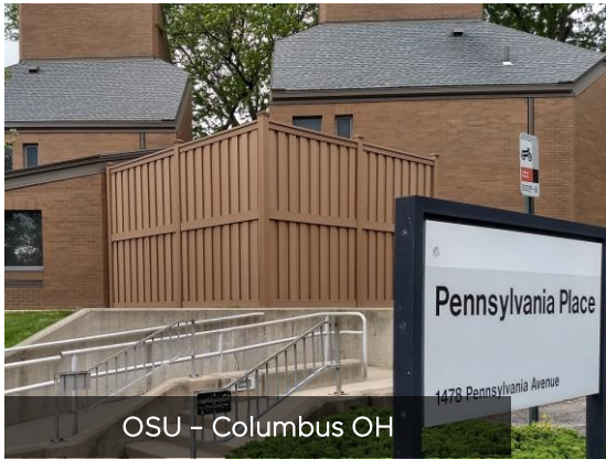
OSU - Columbus OH