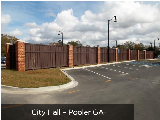
City Hall - Pooler GA