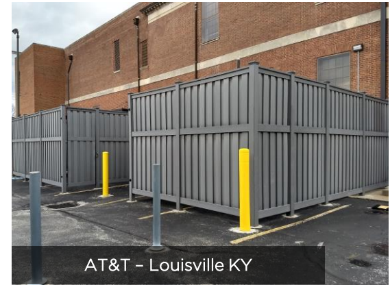
AT&T - Louisville KY