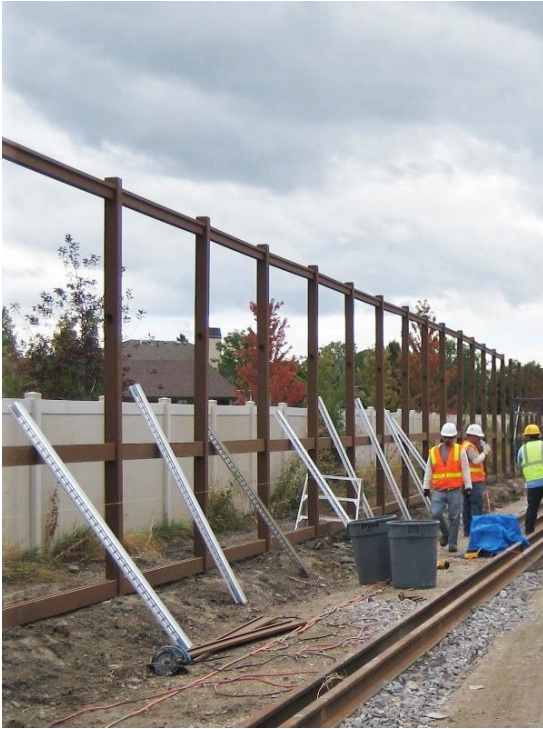
Rails are placed temporarily for accurate measurements