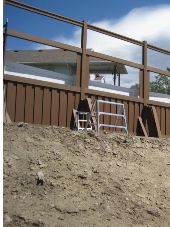
Fence is built from the bottom up using intermediate aluminum rails with composite covers