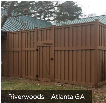
Riverwoods - Atlanta GA