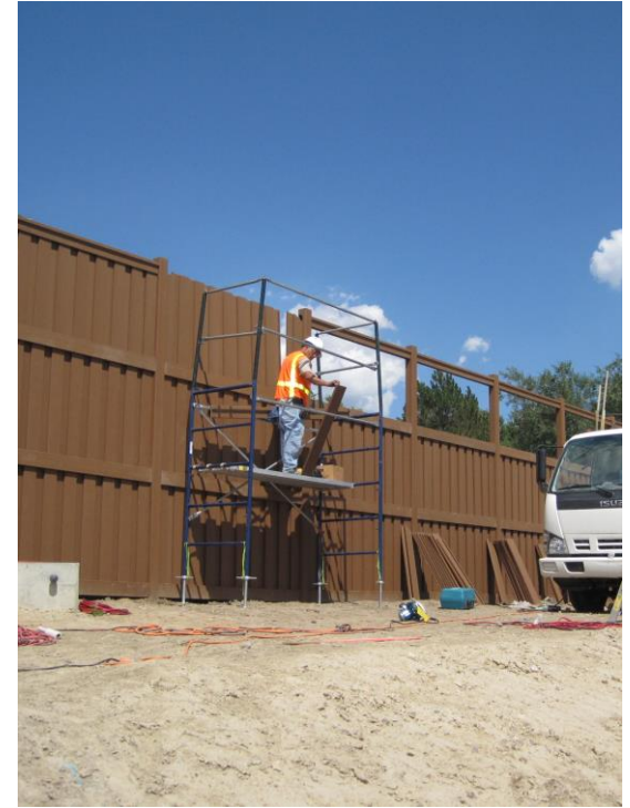
Pickets are interlocked and the top rail is placed over the pickets to ensure fence is secure

Fence is constructed in an assembly line fashion