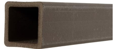
5"x5" Composite Post sleeve over Steel Post Stiffener

Steel Post Stiffeners are used with Trex® Composite Posts