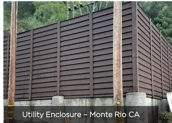
Utility Enclosure - Monte Rio CA