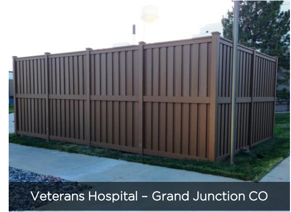
Veterans Hospital - Grand Junction CO