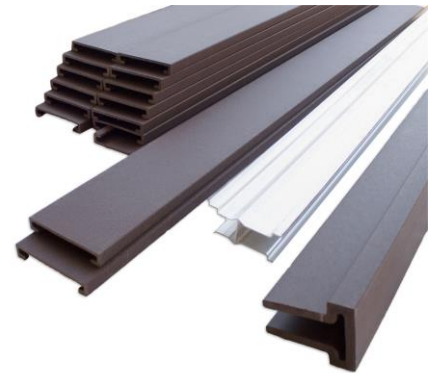
Trex Fencing panels are assembled in field