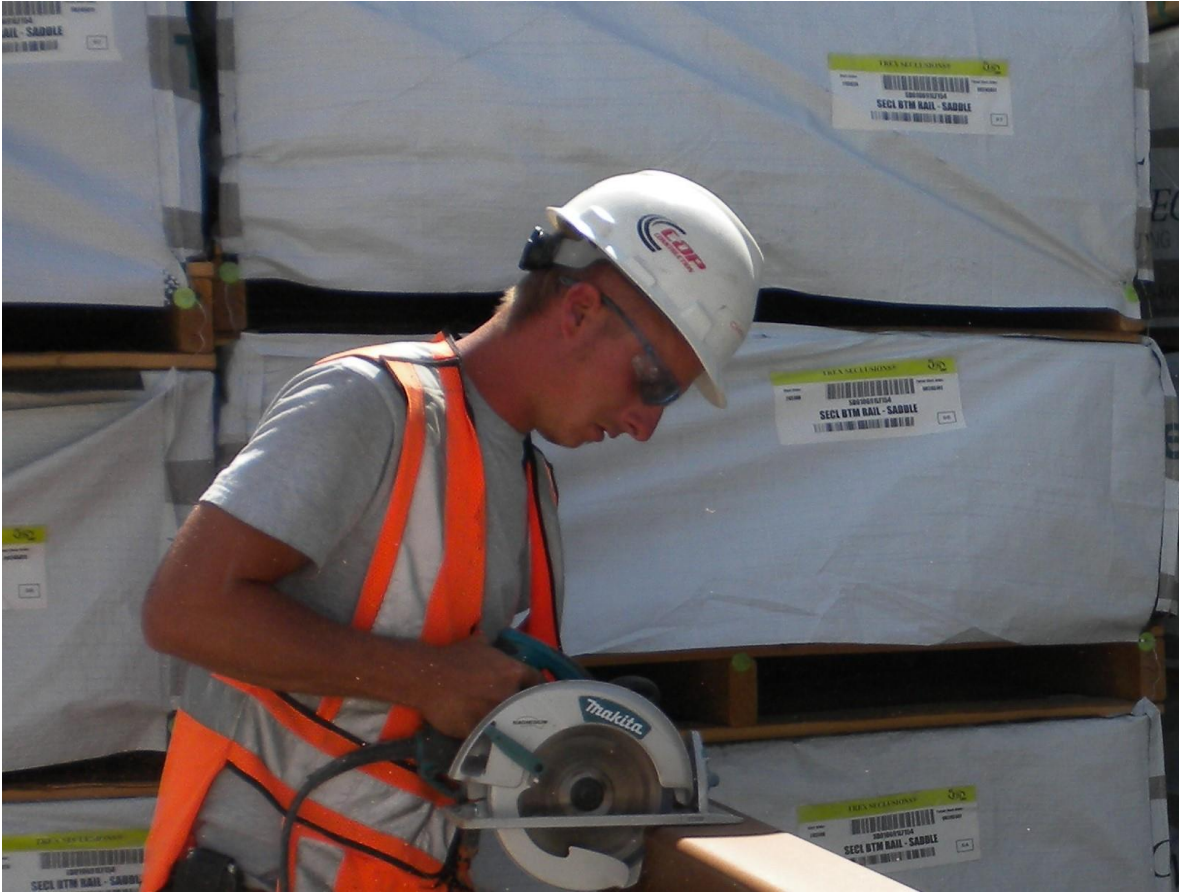
Rails and Pickets are cut to length